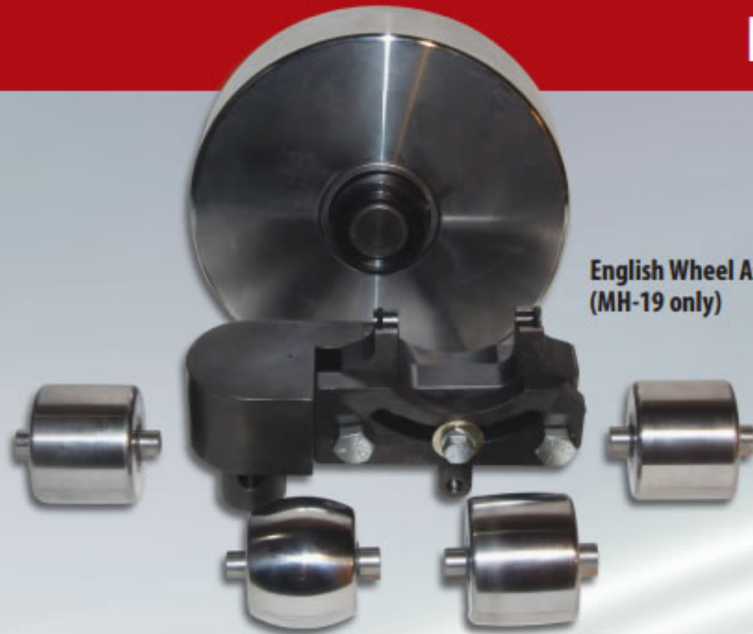
English Wheel Assembly (MH-19 only)