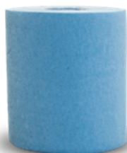
50505-48 Sub-Micronic Cartridge Option