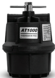
50500-12 Sub-Micronic Air Filter Option