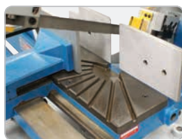
Dual Mitre Vice EB-320DS