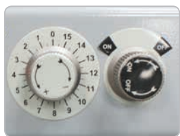
Variable Feed Control EB-320DS