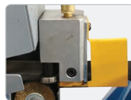
Ball Bearing & Carbide Guides EB-320DS