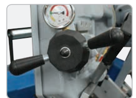
Blade Tension Gauge EB-320DS