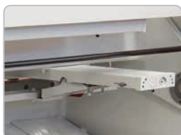
NC Leadscrew Backgauge