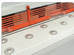
Material Transfer Balls