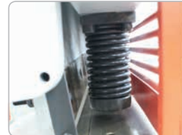
Hydraulic Material Hold Downs