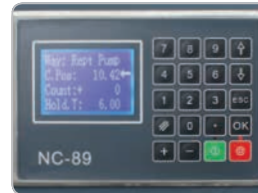
Ezy-Set NC-89 Controller