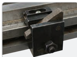
Flip Over Material Stop