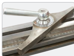
Adjustable & Sliding Mitre