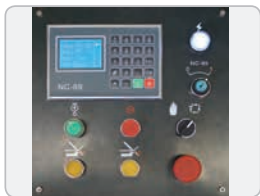
NC-89 Digital Control