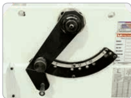
Quick Action Head Adjustment