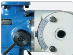
Tilting & Rotating Head BM-23A