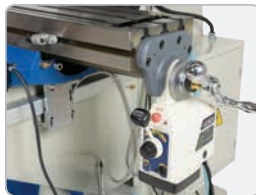
X-Axis Power Feed Unit BM-23A