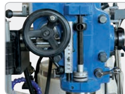
Quill Feed Depth Stop BM-23A