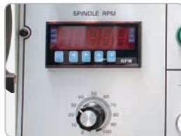
Digital Spindle Speed Readout BM-70VE