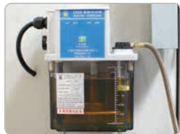
Automatic Oil Lubrication BM-70VE