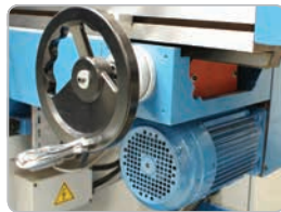
Heavy Duty Power Feed Motors BM-70VE