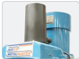
Pneumatic Drawbar System BM-70VE