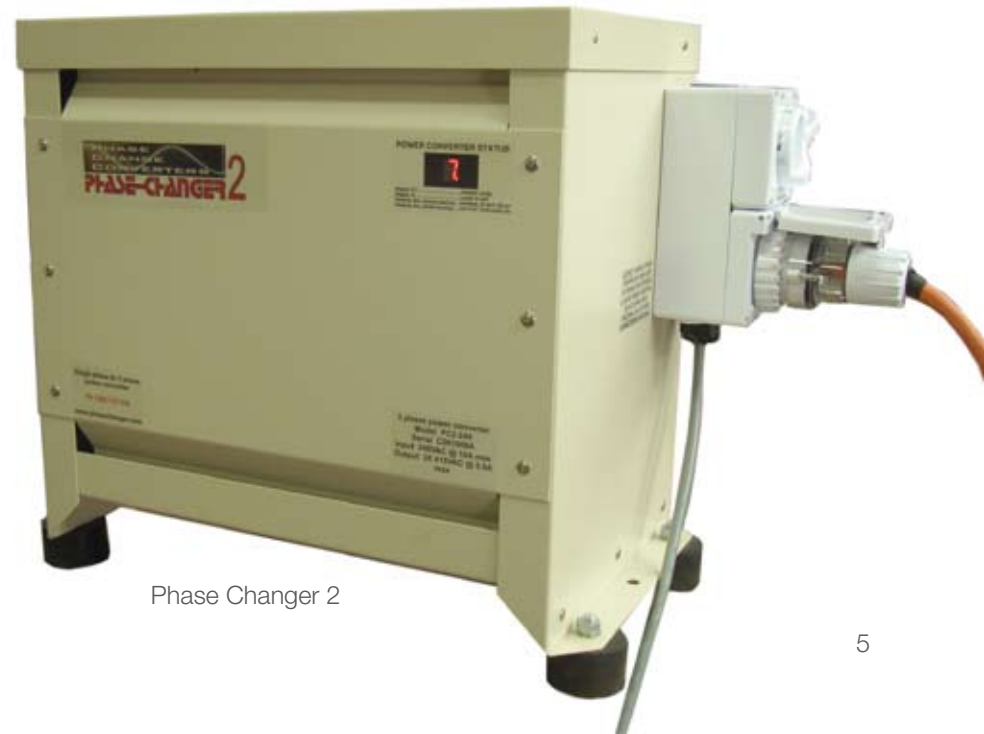
Phase Changer 2

Compare the cost of a Phase-Changer to the cost of connecting to a utility power supply, and in most cases the Phase-Changer will cost far less. And you own it. It can be relocated or resold if your circumstances ever change.